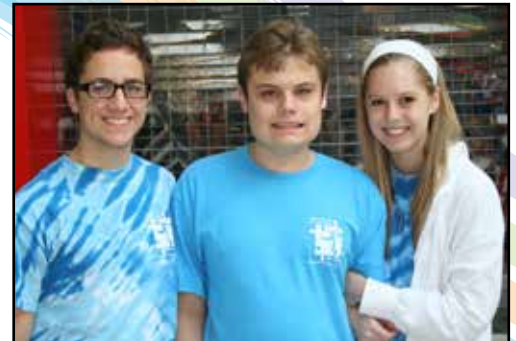
Autism Awareness Walk