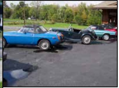
Happiness House Car Show Sponsored by Geneva Foreign & Sports