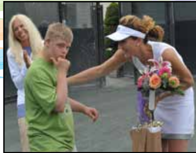
Girl's Day Out: Morning with Monica Seles