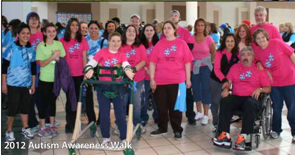
2012 Autism Awareness Walk

Change lives forever. Donate online at happinesshouse.org