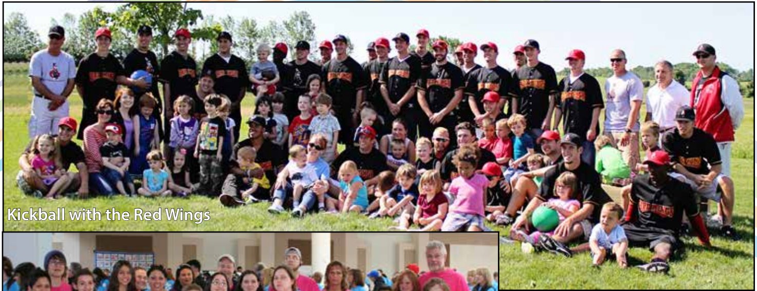
Kickball with the Red Wings