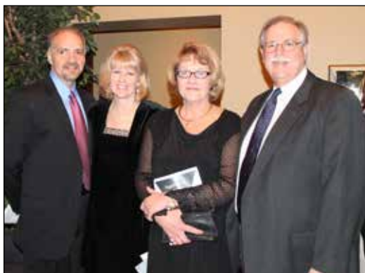
Belhurst, Founding & Major Sponsor Happiness House Annual Gala Dinner & Auction Event presented by Five Star Bank

The Happiness House Foundation is a not for profit organization established to raise and generate funds that will promote, support and augment the continuation of long term services for people with disabilities offered by Happiness House in Ontario, Seneca, Wayne and Yates Counties.