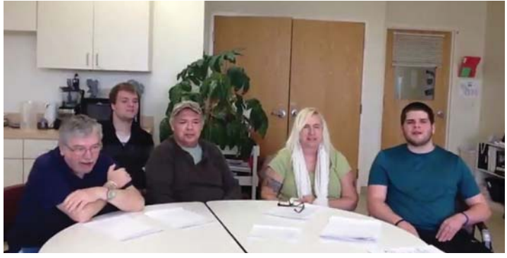
TBI participants encouraged employees and others to wear their jeans to work to raise awareness of Brain Injury Awareness Month.

Many of our Traumatic Brain Injury (TBI) program participants shared their stories in videos that were posted on Facebook. Living with a TBI is sometimes frustrating and challenging, but each of our participants found help. They are all participants in TBI programs at Happiness House. Engaging in activities, seeking assistance through supportive programs, and being patient with themselves and others allows those living with TBI to be their best. Happiness House offers programs to help those with TBI maintain or improve one's ability to live in the community, including: