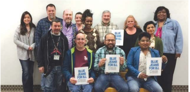
Top left: Happiness House team at Canandaigua Bottom left: Rochester Rehabilitation team at University Ave.