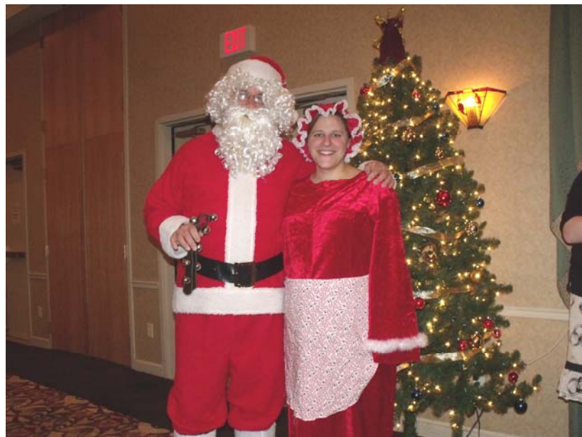
Mr. and Mrs. Claus